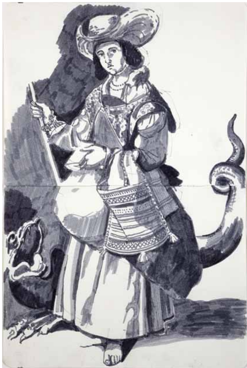
Drawing by Poppy Chancellor