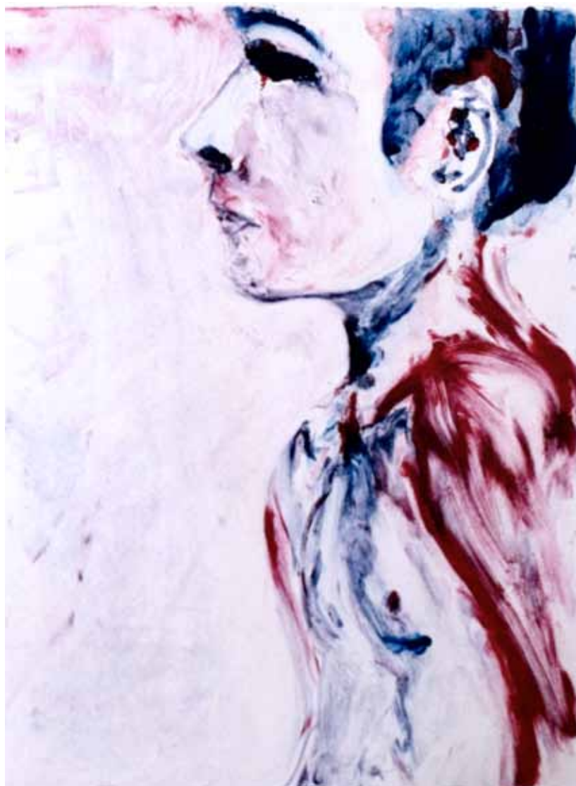
Monoprint by Nhatt Nichols